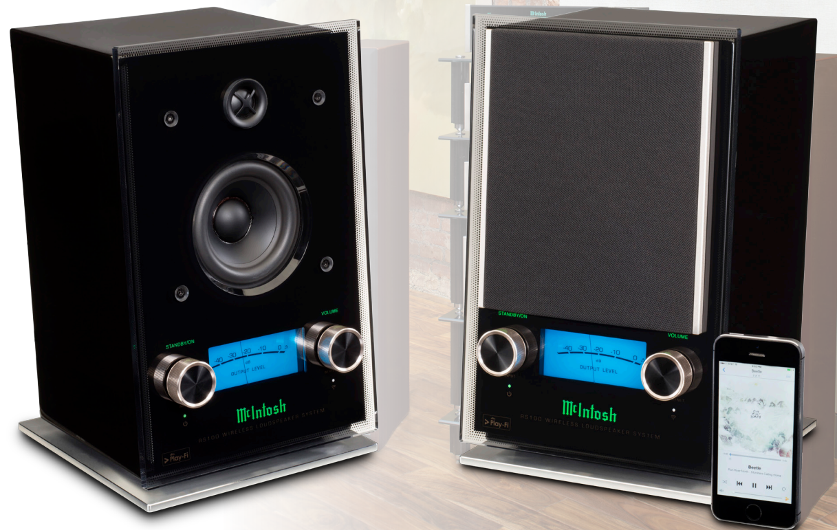
iPhone shown with DTS Play-Fi app. iPhone not included. Speakers sold individually.

1. All services may not be available in all regions; certain services may not yet be enabled for all apps; subscriptions may be required. List subject to change.